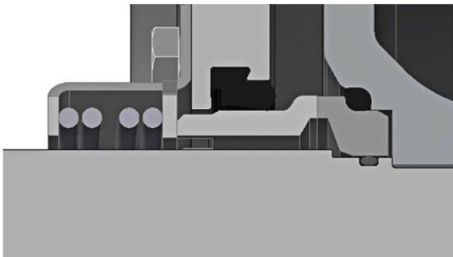
Figure 2. The design of the axial face seal in detail.

Thanks to the modularised construction, the floating rings, counter-rings and the elastomer seals can be individually replaced without having to separate the pump from the motor. Simple assembly has been designed into the motor, as with the floating ring seal, which can be quickly dismantled into its individual parts; here, too – as with the valves – the risk of confusing components during assembly has been eliminated.